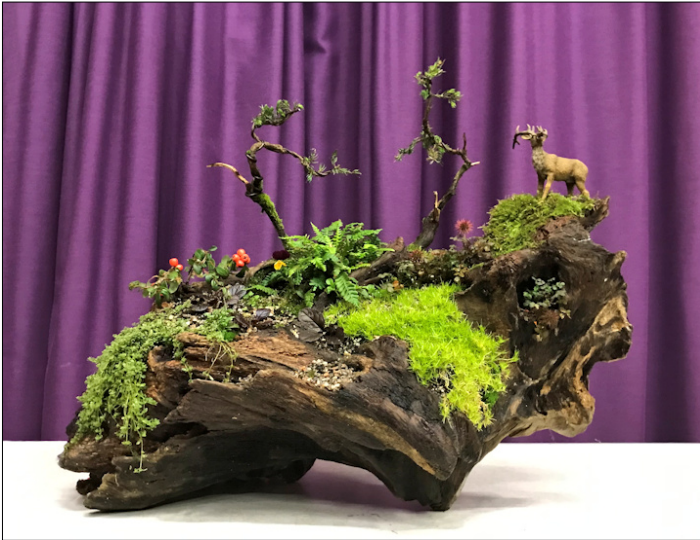
Geoff's landscape, with a log for a pot

Ade explains the "guidelines" for pot selection